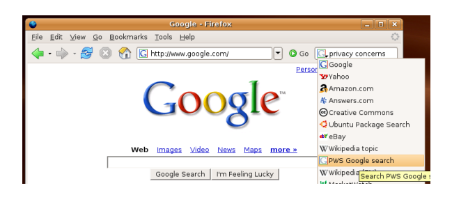
Figure 3: PWS user interface

The PWS plugin is distributed as a single .xpi file that, to be installed, needs to be dragged into the plugin installation window. Once it's installed, Firefox will need to be restarted. After that, a new search option will show up among the search engines in the search box (see figure 3). That search option is labeled "PWS Google search." When the user searches using this option, the query will be routed through the HTTP proxy and the Tor client. The response will take some more time and will look different from the standard Google response, because the HTML was filtered and then displayed. Notice that the user can choose between regular Google queries and PWS just by selecting accordingly from the search box.