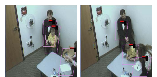
Figure 3: Two tracking images from the left camera of a calibrated stereo cameras rig. Individuals are tracked as they move throughout one of our clinical evaluation rooms during an interview session.

average r =.63). This was the first experimental measure to successfully predict level of social competence in real life for individuals with autism. Visual fixation data related to viewing of naturalistic scenes of caregivers' approaches reveals markedly different patterns. Toddlers with autism fixate more on the mouth region rather than on eye regions of faces. Combined with experiments probing these children's capacity for mentally representing human action, it has been suggested that these children are treating human faces as physical contingencies rather than social objects (they fixate on mouths because of the physical contingency between sounds and lip movements). Although visual fixation on regions of interest are sensitive measures of social dysfunction, moment-by-moment scan-paths are even more sensitive and offer further insight into the underlying dysfunction (see section 5 for an example) [9].