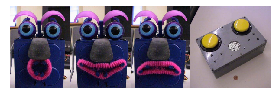
Figure 1 : Three facial expressions from the ESRA robot and the Playtest device (right). See section 4.2 for information on Playtest.

dolls, a spherical robot ball with eyes, and an expressive snowman-like device. These robots show a wide range of anthropomorphic characteristics, behavioral repertoires, aesthetics, and sensory and interactive capabilities. While there are many studies of the effects of these interaction variables on typical adults, very little is known about how individuals with autism respond to these design dimensions.