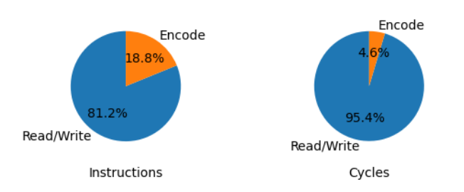
Figure 2: The makeup of Protobuf serialization for a message of three, 64-bit unsigned integers.

Zerializer: Towards Zero-Copy Serialization